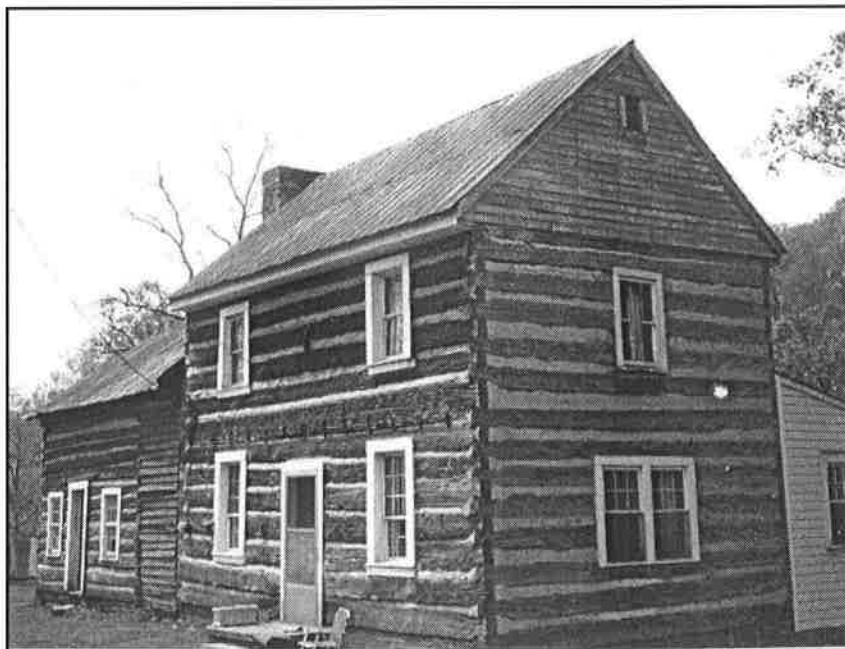
Figure 2: Main Façade of Spring Place