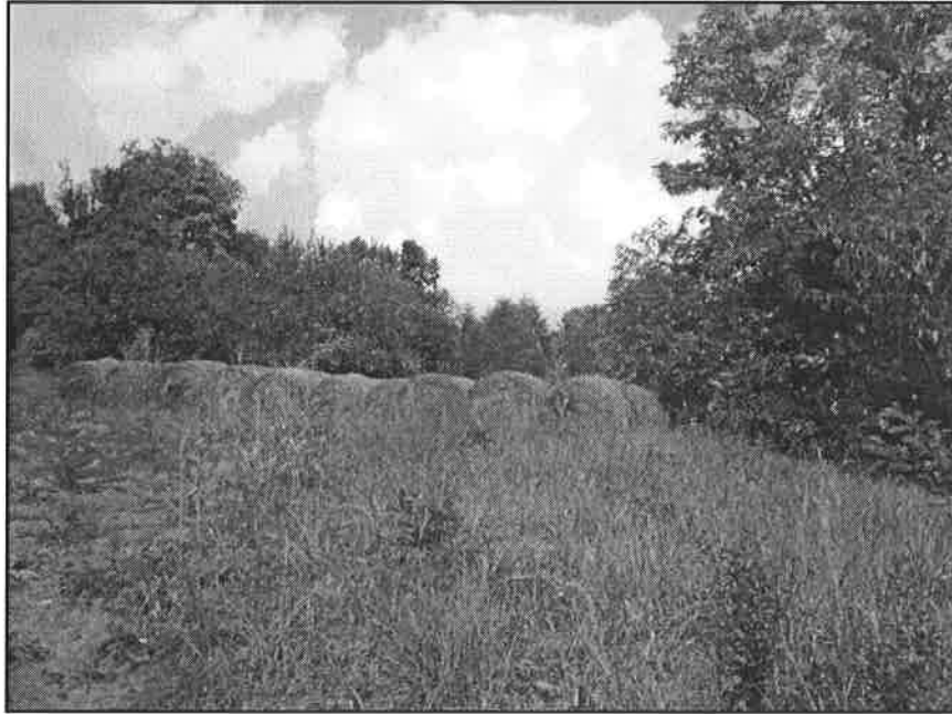
Figure 5: Current status of original site of Spring Place.