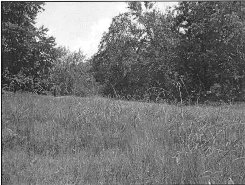
Figure 4: Current Status of original site location.