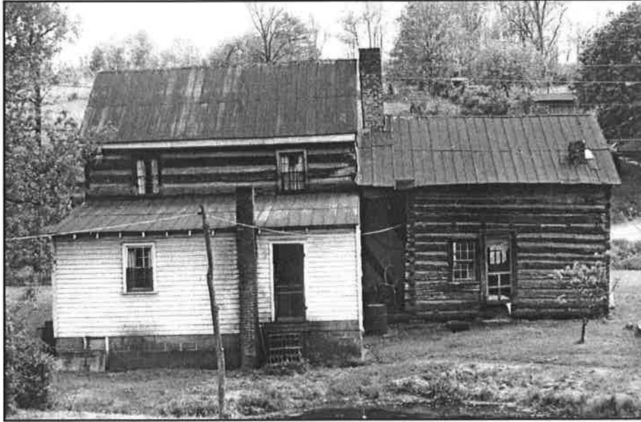
Figure 3: Rear elevation of Spring Place.