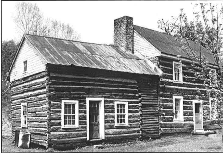
Figure 1: Main Façade of Spring Place.