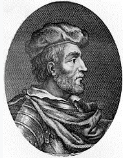
Anachronistic depiction of Duncan I by Jacob de Wet, 17th Century