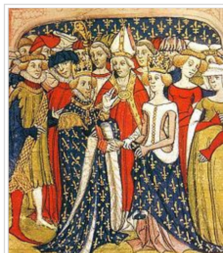
Marriage of Philip and Marie of Brabant, Queen of France