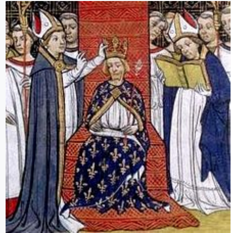
Coronation of King Philip III