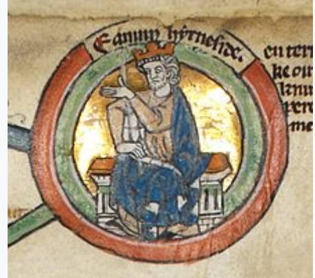
Edmund in the early fourteenth century Genealogical Roll of the Kings of England