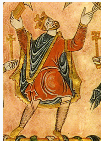
A contemporary portrayal of King Edgar in the New Minster Charter.