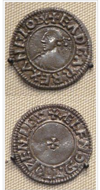
A coin of Edgar, struck in Winchcombe (c. 973-75).