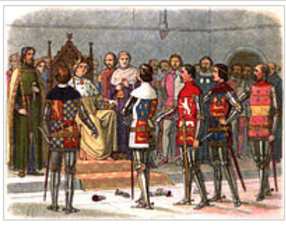
Depiction of Mowbray, Arundel, Gloucester, Derby and Warwick demanding of Richard II that he let them prove by arms the justice of their rebellion. From the left of the painting, Mowbray is the third man standing.

In 1398, Norfolk quarreled with Henry of Bolingbroke, 1st Duke of Hereford (later King Henry IV), apparently due to mutual suspicions stemming from their roles in the conspiracy against the Duke of Gloucester. Before a duel between them could take place, Richard II banished them both. Mowbray left England on 19 October 1398. [6] While in exile, he succeeded as Earl of Norfolk when his grandmother, Margaret, Duchess of Norfolk, died on 24 March 1399. [6]