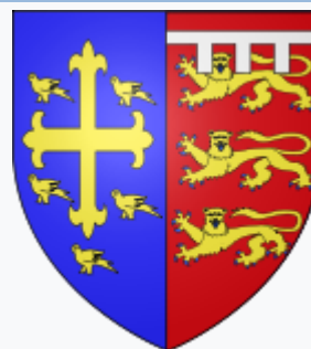
Arms of Thomas de Mowbray, 1st Duke of Norfolk

Spouse(s) Elizabeth le Strange Elizabeth Arundel