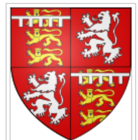
Arms of Thomas de Mowbray as Earl Marshal, ca.1395

He married firstly, after 20 February 1383, Elizabeth le Strange (c. 6 December 1373 – 23 August 1383), suo jure Lady Strange of Blackmere, daughter and heiress of John le Strange, 5th Baron Strange of Blackmere, by Isabel Beauchamp, daughter of Thomas Beauchamp, 11th Earl of Warwick, by whom he had no issue. [3]