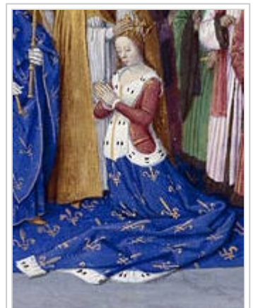
Marie, at her coronation